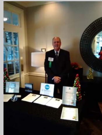
ONE POSITIVE PLACE