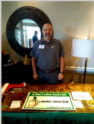
THE LAWN DOCTOR OF LAGRANGE— WILLOWBROOK