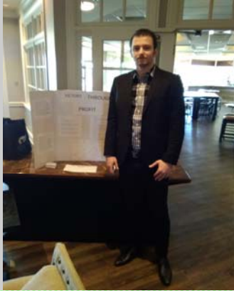
VICTORY THROUGH PROFIT